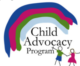
CAP Board President